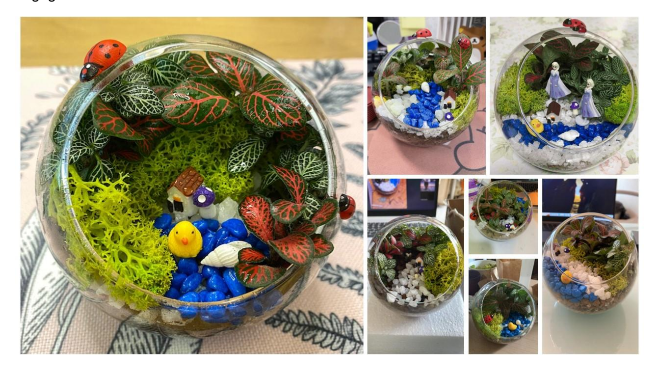
At the Online Terrarium Workshop, Hong Kong Life corporate volunteers and underprivileged children learned about ecosystems and global climate change and unleashed their creativity by creating their own micro-ecosystems.

underprivileged in society through volunteering. At the onset of the pandemic, the physical and mental well-being of the needy and society-at-large has become a great concern. The Company will continue to seek proactive solutions to support different groups in need in our community who are most vulnerable during the pandemic, as well as to support the sustainable development of our community through responsible business operations and community engagement.